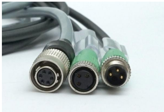
Fig. 3 – Cable connectors: from left Hirose connector for camera connection, M8 female for illuminator and M8 male for power supply