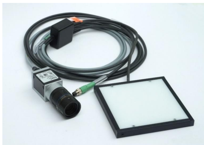
Fig. 4 – Example of cabling with camera and illuminator